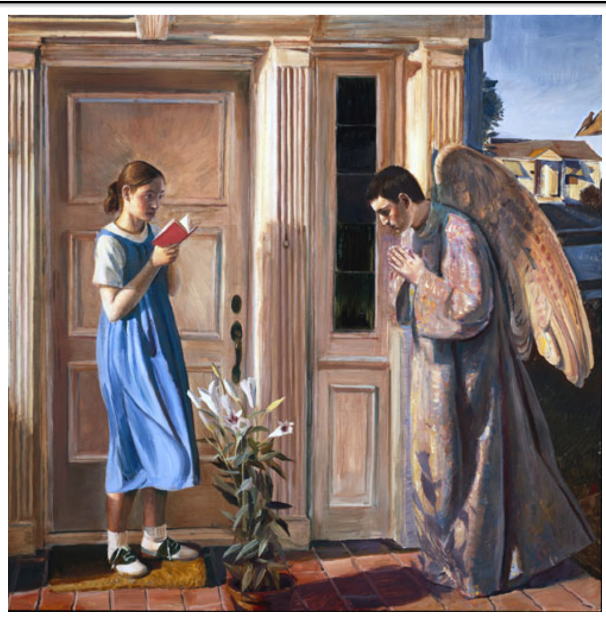
EXPECTING THE ORDINARY?